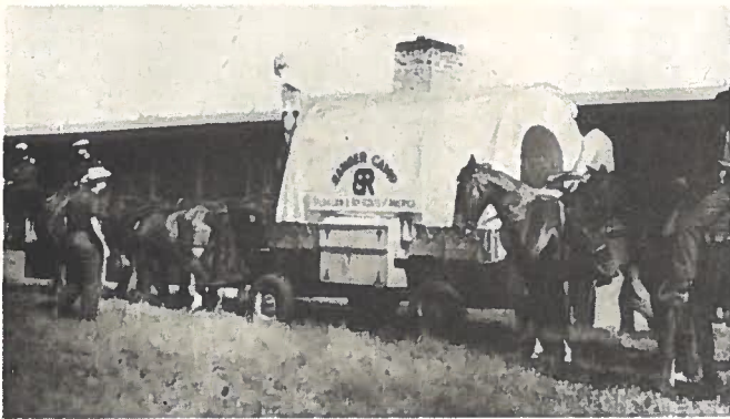
Chuck Wagon 1957