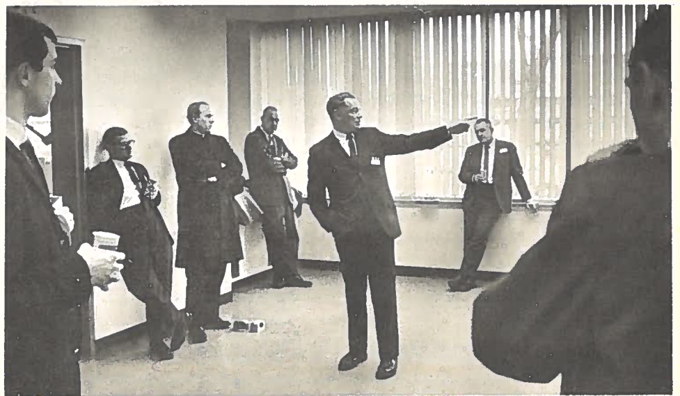
Tour of New St. Louis Council Service Center 1967