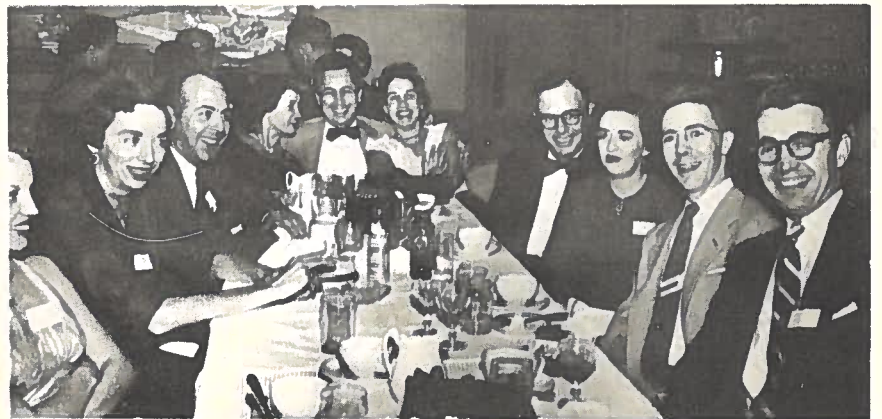
1957 Oops -- Not Irondale