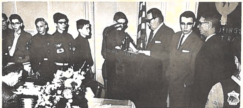
Eagles' Recognition Day 1959