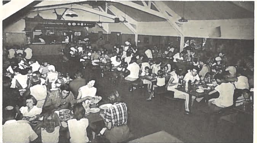
Mess Hall 1956