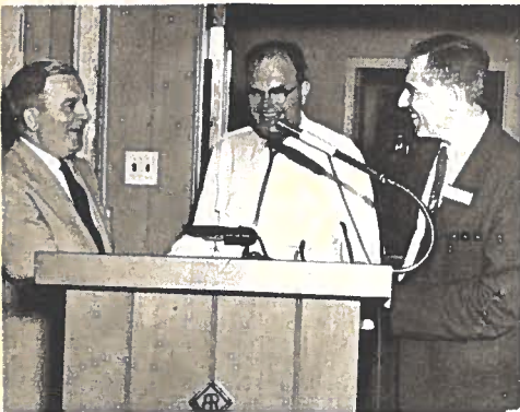
Eagles' Recognition Day 1957