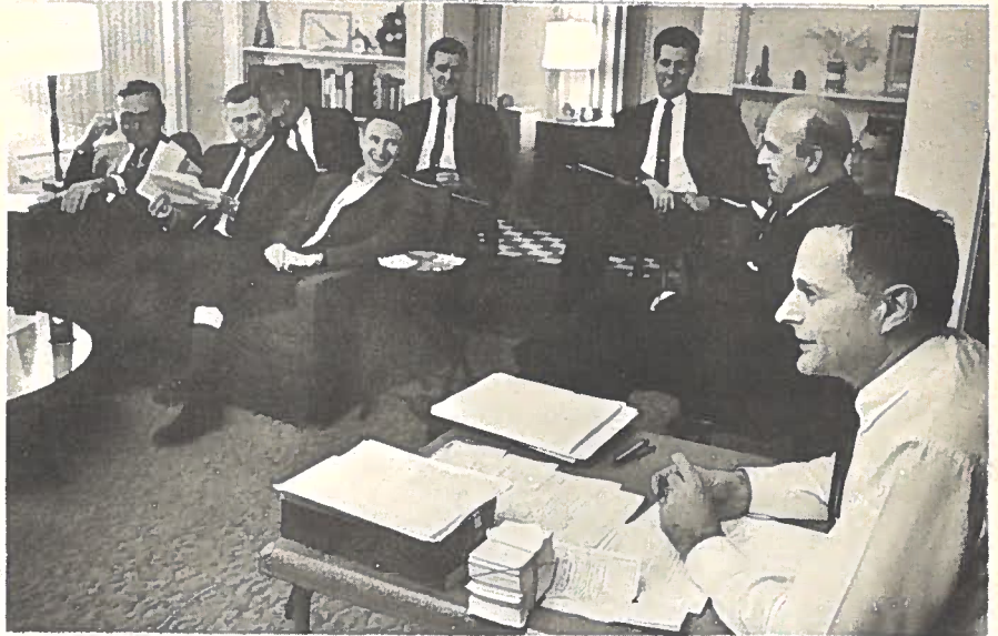
Board Meeting 1967