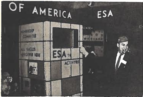
ESA Booth Scout Exposition 1954