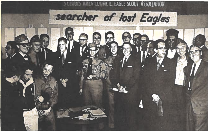
S.O.L.E. Campaign at Scout Exposition 1960