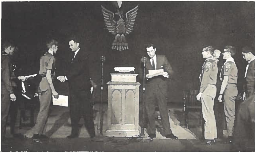
Eagles' Recognition Day 1967