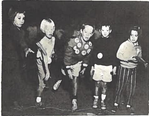
Kids' Campfire 1964