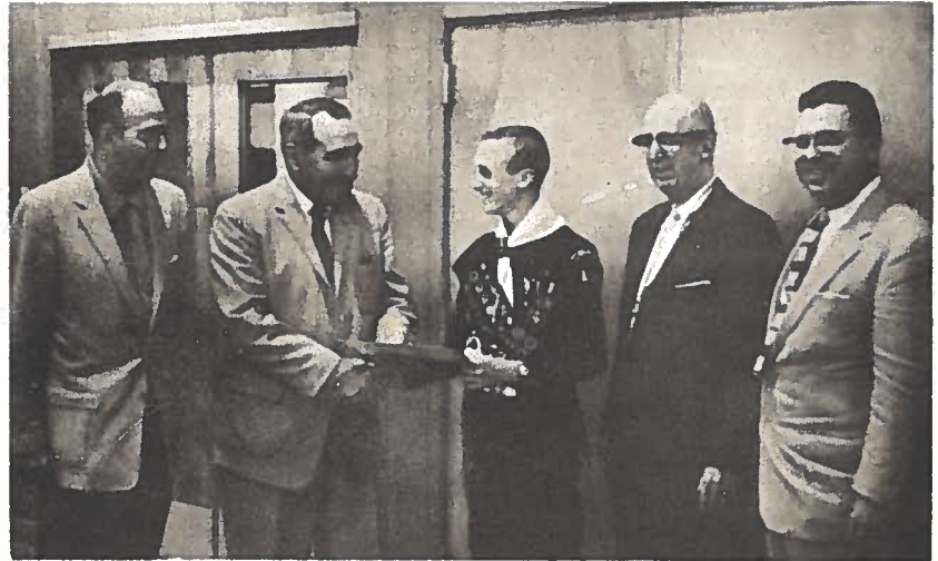
Eagles' Recognition Day 1958