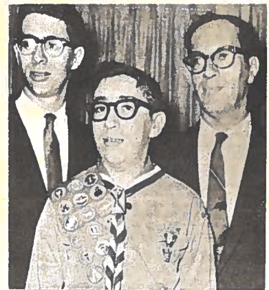
Family of Eagles 1965