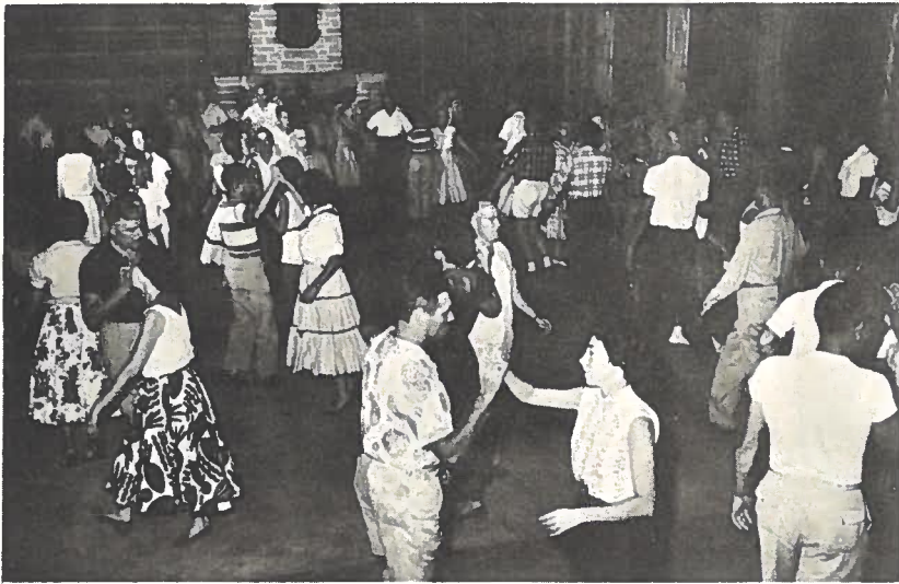
Square Dance 1956