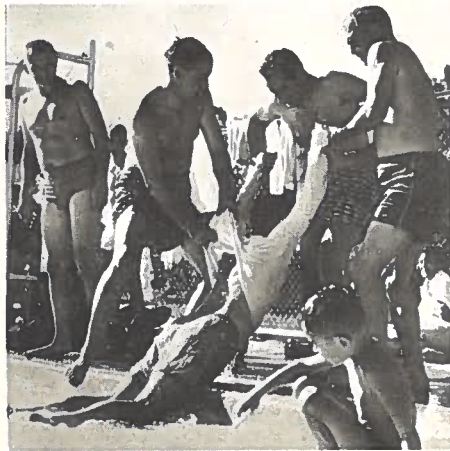
Swim Carnival 1956