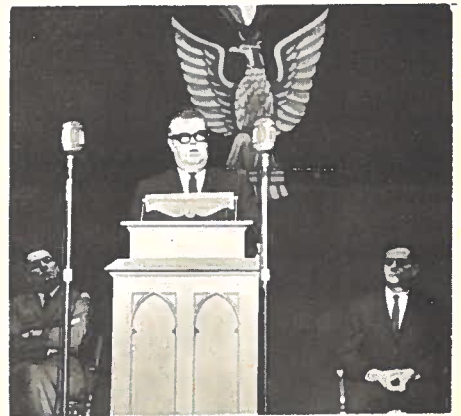
Eagles' Recognition Day 1967