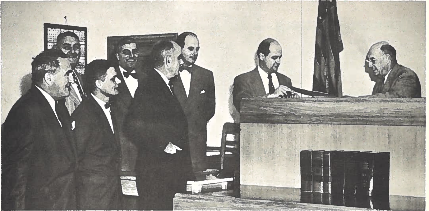
In the beginning ESA Incorporation