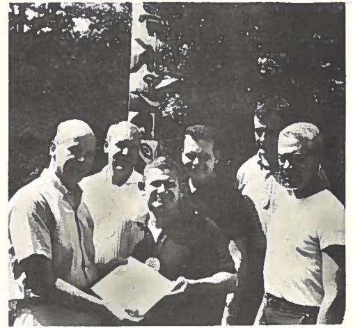
Change of Presidents 1963